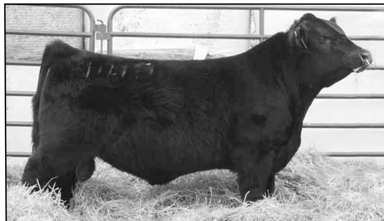
Lot 113 - Filhart 1415