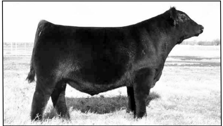
EXAR Classen 1422B - Sirel of lot 109