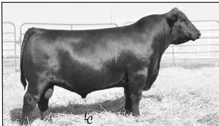
Schiefelbien HD 1241 - Sire of lot 104 & 105

Sired by the very popular calving ease sire, Schiefelbien HD 1241. This one is thick, uniform, and structurally sound. He should sire heavy muscled and well balanced calves. Very docile. 50K data will be available at the sale. Actual birth weight of 76 lbs. Lutchka Angus is TB accredited free, Johnes free level 6, and BVD free.