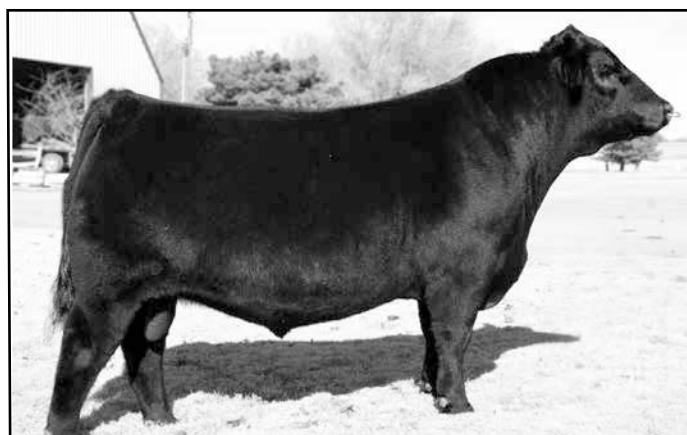
Dameron First Impression - Sire of lot 103