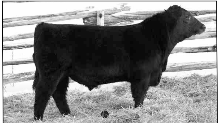
Lot 110 - Reidholm Final Cut 212B