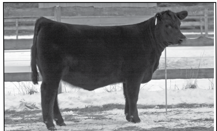
Lot 122 - FF Raven 450