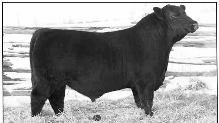
Lot 109 - Reidholm Bob 210B