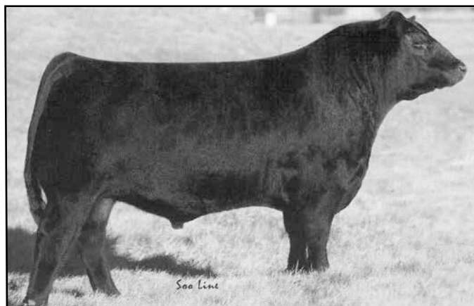
Soo Line Motive 9016 - Sire of Lot 124

Cow Reg. No. 17866058 Tattoo: R224 Calved: 3/26/2014 TC Freedom 104 HF Kodiak 5R Wilbar Ruby 955N Soo Line Motive 9016 RR 7407 Rainmaker 2154 TLA Beauty 5R Terriene Beauty 35F Leachman Right Time 338- WMR Timeless 458 WMR Blackcap 521 Rains Timeless Barbera TIFr Sandy Bar Advantage 43M Rains Freda Barbera FrD381 Rains Barbara D381 This is a nice made, moderate framed daughter of Motive, the popular $110,000 valuation bull at the 2010 Bases Loaded Sale. She is out of a first calf heifer by Timeless and back to Freedom and Dateline. Here is a late March female with very balanced EPD's. Birth weight: 65lbs. AWW: 673 lbs. Calfhood vaccinated. Rains Angus is a certified and accredited John's Free Herd. Consignor: Rains Angus