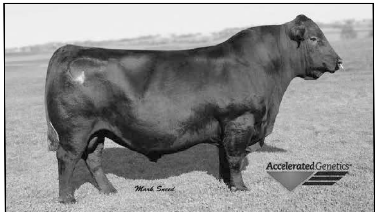
Connealy In Focus - Sire of lot 108

BW WW YW Milk Mrb RE Fat ($B) 1.3 57 96 26 0.34 0.68 -0.03 110.73