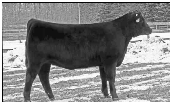
Lot 123 - FF Blossom 416

Cow Reg. No. 17928618 Tattoo: 416 Calved: 4/9/2014 Bon View New Design 878 SAV Final Answer 0035 SAV Emulous 8145 MSU Final Four 920 Boyd Network M275 MSU Ruby of Tiffany 734 MSU RUBY of TIFFANY 536 SAV 004 Predominant 4438 SAV Providence 6922 SAV May 7238 SH Blossom 0200 Sitz Traveler 8180 Masterfare LG Blossom 4013 LSF Blossom 5357 LG312 416 is a super performance heifer with a 1.1BW EPD and a 93 YW EPD and a current $B of 91.57. Phenotypically this heifer is outstanding! She is level made, super sound structured and eye appealing. Additionally, she has a great disposition, one that my 7 year old can lead. Juniors take note: this is a heifer that can be shown and then make all your money back in the donor pen! She is another Blossom that we should not be selling. Her sister sold to Ohio for $4000 in the Expo two years ago. Consignor: Fitzner Farms