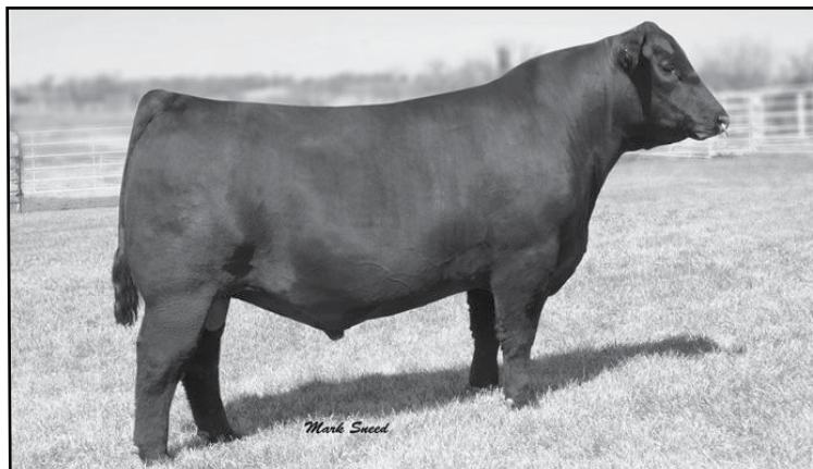
SAV Brilliance 8077 - Sire of Lot 129