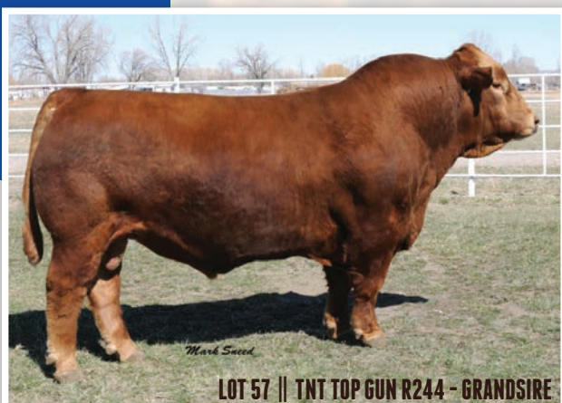
LOT 57 || TNT TOP GUN R244 - GRANDSIRE