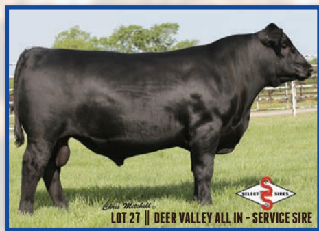
LOT 27 || DEER VALLEY ALL IN - SERVICE SIRE