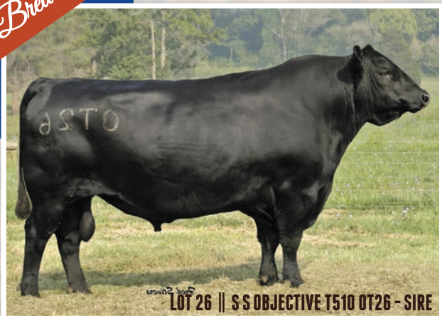
LOT 26 || S S OBJECTIVE T510 OT26 - SIRE