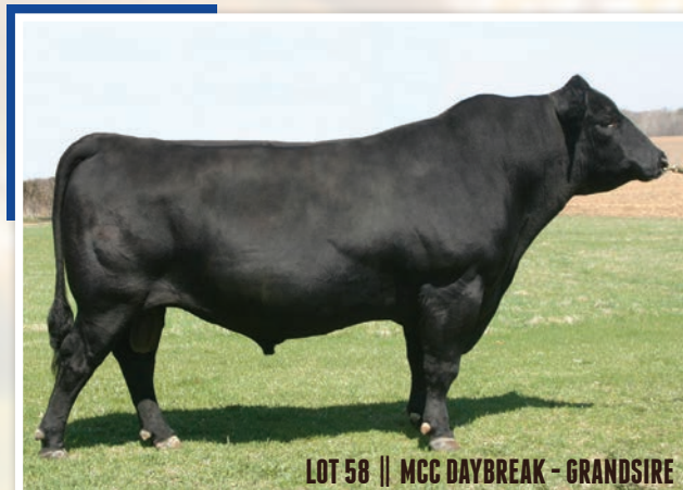
LOT 58 || MCC DAYBREAK - GRANDSIRE