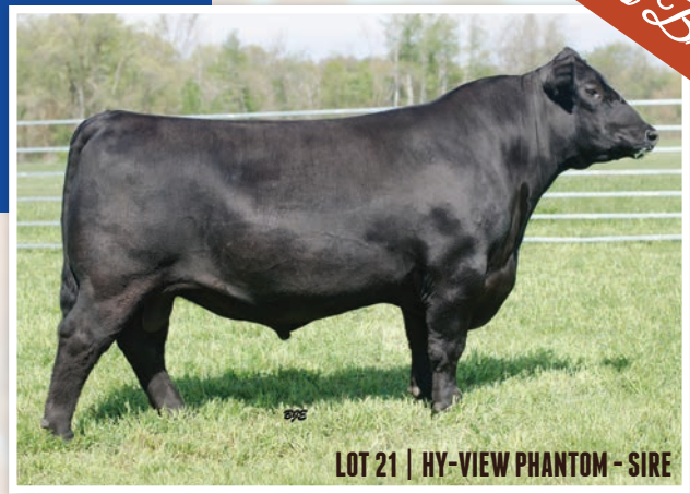
LOT 21 | HY-VIEW PHANTOM - SIRE

- AI'd 1/3/16 to SANDPOINT BUTKUS X797 (AAA# 16829413) - This cow is out of 2301, a great combination of performance genetics, A Hy-View Phantom daughter, and bred to Sandpoint Butkus has a BW of -1.5 and YW of 134. Halter broke and due 10-12-16