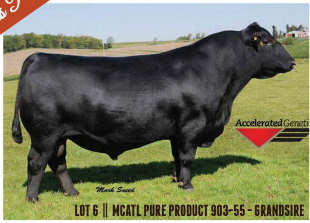
LOT 6 || MCATL PURE PRODUCT 903-55 - GRANDSIRE