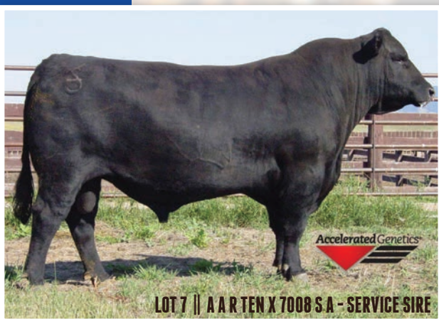
LOT 7 || A A R TEN X 7008 S A - SERVICE SIRE

BD: 9/3/16 || AAA#: PENDING || Tattoo: 614D || PB AN Sire: KB CARCASS MERRITT A02