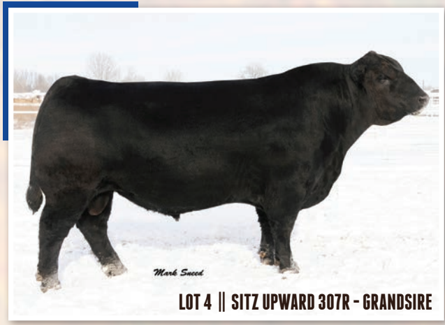
LOT 4 || SITZ UPWARD 307R - GRANDSIRE

Consignor: LUTCHKA ANGUS - PE 8/22/16 - 10/10/16 LA DANNY BOY GRANITE 1015 (AAA# 18327469) 4A | Heifer Calf | LA LENORE INCENTIVE 2816 BD: 6/2/16 || AAA#: 18544826 || Tattoo: 2816 || PB AN Sire: L A INCENTIVE 412