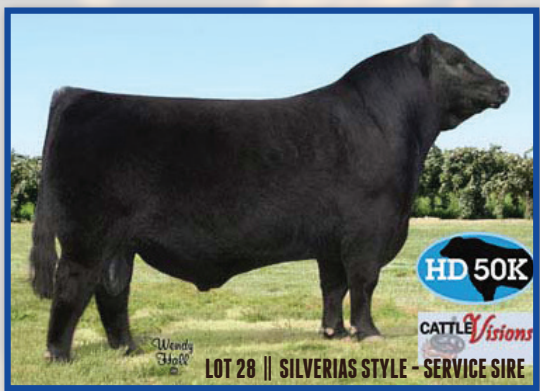
LOT 28 || SILVERIAS STYLE - SERVICE SIRE