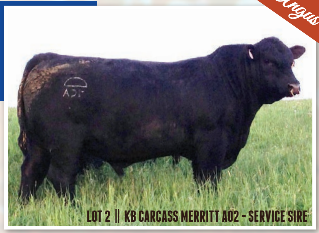
LOT 2 || KB CARCASS MERRITT A02 - SERVICE SIRE

Consignor: BORDNER FARMS LLC - PE 6/13/16 - 9/15/16 to KB CARCASS MERRITT A02 (AAA# 17519154) 2A | Heifer Calf | BAF Queen A02 612D BD: 6/3/16 || AAA#: PENDING || Tattoo: 612D || PB AN Sire: KB CARCASS MERRITT A02