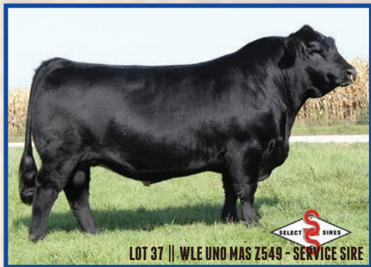
LOT 37 || WLE UNO MAS Z549 - SERVICE SIRE