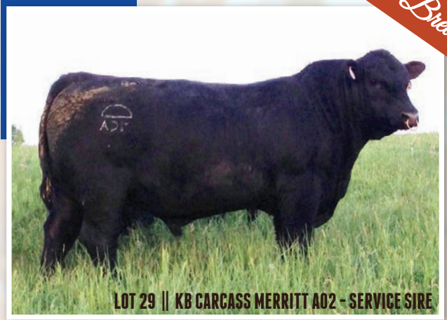
LOT 29 || KB CARCASS MERRITT A02 - SERVICE SIRE

- PE 5/15/16 - 9/15/16 to KB CARCASS MERRITT A02 (AAA# 17519154) - 435B From a 004 dam Sired by Fast Break, she sells bred to KB Carcass Merritt A02.