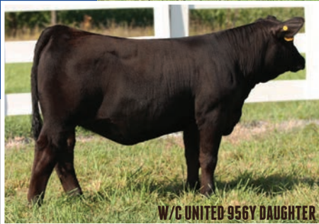
W/C UNITED 956Y DAUGHTER