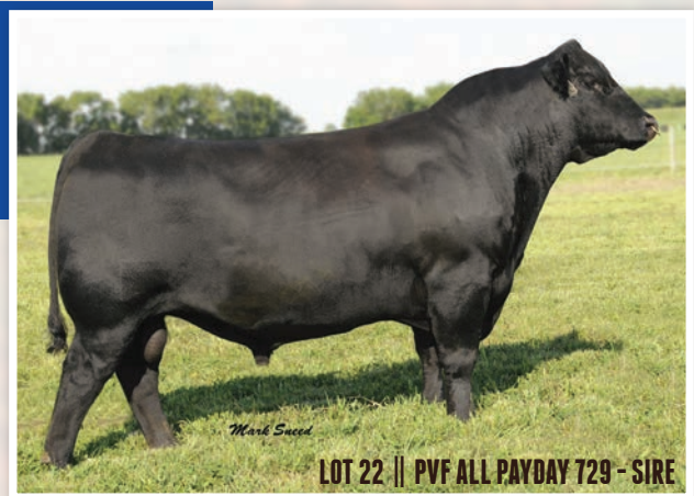
LOT 22 || PVF ALL PAYDAY 729 - SIRE

- AI'd 8/3/16 to SFSM ICON A1 (ASA# 2740616)