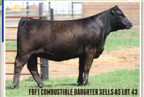
FBF1 COMBUSTIBLE DAUGHTER SELLS AS LOT 43