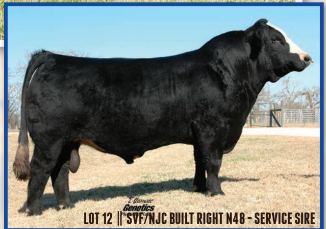
LOT 12 || SVF/NJC BUILT RIGHT N48 - SERVICE SIRE