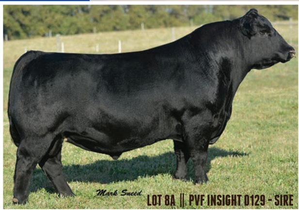
LOT 8A || PVF INSIGHT 0129 - SIRE

BD: 4/30/16 || AAA#: 18520265 || Tattoo: 6230 || PB AN Sire: HY-VIEW PHANTOM