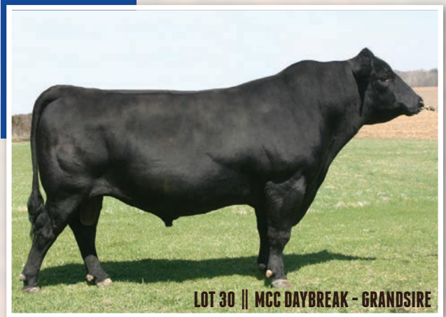
LOT 30 || MCC DAYBREAK - GRANDSIRE

- PE 5/15/16 - 9/15/16 to KB CARCASS MERRITT A02 (AAA# 17519154) - 501C by Fast Break sells bred to KB Carrcass Merritt A02