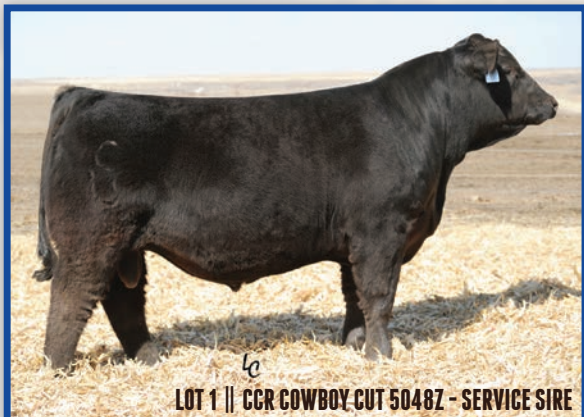
LOT 1 || CCR COWBOY CUT 5048Z - SERVICE SIRE