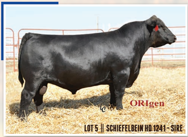
LOT 5 || SCHIEFELBEIN HD 1241 - SIRE

Consignor: LUTCHKA ANGUS - PE 8/22/16 - 10/10/16 LA DANNY BOY GRANITE 1015 (AAA# 18327469) 5A | Bull Calf | LA RIGHT FRONTIER 4416 BD: 8/3/16 || AAA#: 18544827 || Tattoo: 4416 || PB AN Sire: LA 2500 HD 414