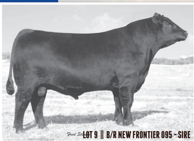
LOT 9 || B/R NEW FRONTIER 095 - SIRE

BD: 5/10/16 || AAA#: PENDING || Tattoo: || PB AN Sire: PVF INSIGHT 0129