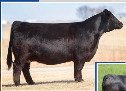
LOT 41 || JS FLATOUT FLIRTY 46T GRANDDAM