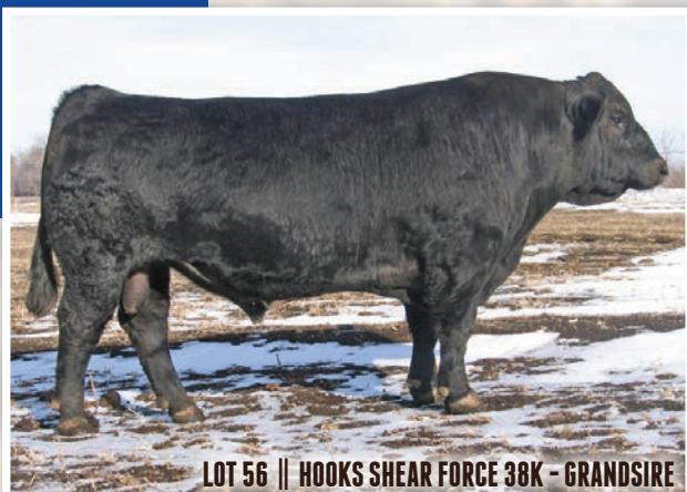
LOT 56 || HOOKS SHEAR FORCE 38K - GRANDSIRE