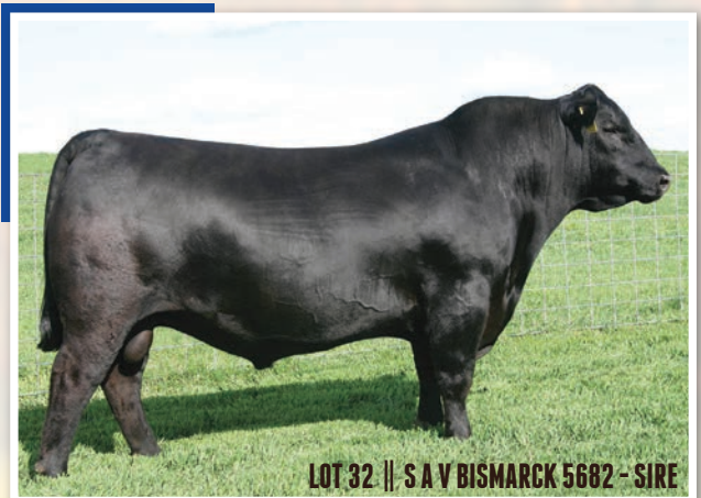
LOT 32 || S A V BISMARCK 5682 - SIRE

- AI'd 7/16/16 to REIDOGA DEFINITIVE R401 (AAA# 18087701)