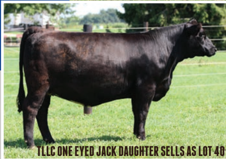
TLC ONE EYED JACK DAUGHTER SELLS AS LOT 40