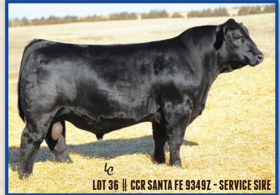
LOT 36 || CCR SANTA FE 9349Z - SERVICE SIRE