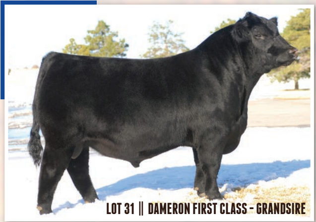
LOT 31 || DAMERON FIRST CLASS - GRANDSIRE

- AI'd 6/10/16 to KRAMERS APOLLO 317 (AAA# 17668327). PE 6/18/16 - 9/24/16 to SFSM ICON A1 (ASA# 2740616) - Pasture exposed bull is a Simmental that was Reserve Jr. Champion at the 2013 World Beef Expo and Supreme Champion bull at the 2013 MI State Fair.