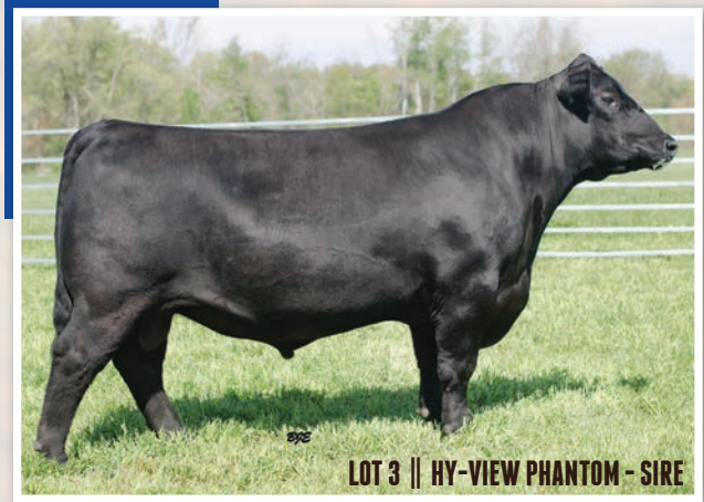
LOT 3 || HY-VIEW PHANTOM - SIRE

Consignor: HY-VIEW FARM - AI'd 8/21/16 to SANDPOINT BUTKUS X797 (AAA# +16829413) 3A | Heifer Calf | HY VIEW MISS SUSIE 6473 BD: 4/29/16 || AAA#: 18520264 || Tattoo: 6473 || PB AN Sire: SEDGWICKS OUTLAW 538W